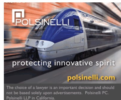
( http://www.Polsinelli.com )