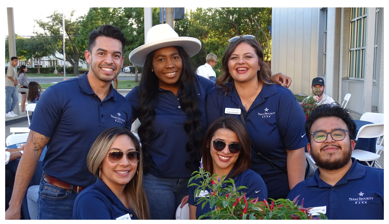
Texas Security Bank workers are shown at the bank's annual barbecue.